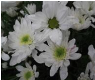
9" WHITE GARDEN MUM