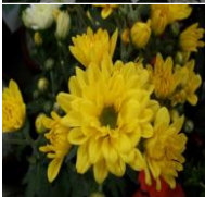
9" YELLOW GARDEN MUM