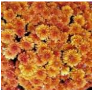
9" ORANGE/BRONZE GARDEN MUM