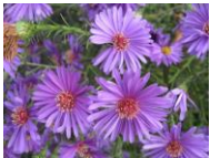
9" PURPLE ASTER