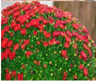
9" RED GARDEN MUM