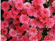
9" PINK GARDEN MUM